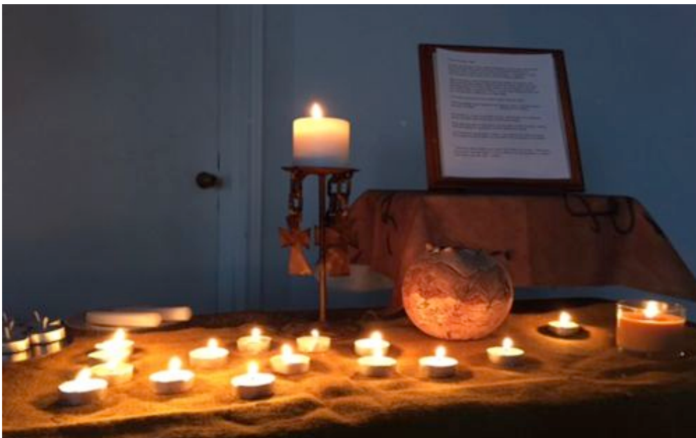
One of four sanctuary prayer stations during the Good Friday evening service.