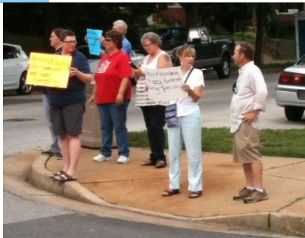
Praying and working for justice and new relationship in our communities