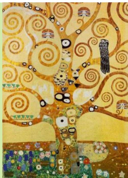
Klimt – Tree of Life